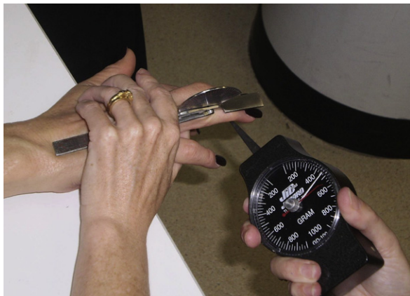
FIGURE 1. Method for taking torque range of motion and torque angle curve measurements for proximal phalangeal joint extension deficit. Proximal joints are stabilized in a neutral position while the force is applied through the tip of the Haldex gauge at the volar DIP joint crease.