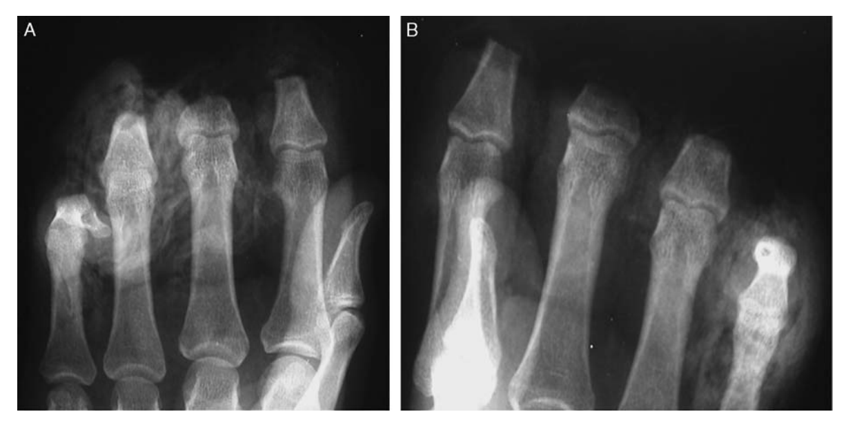
FIGURE 4. Plain radiographs of bilateral multiple finger amputations of a 19-year-old male.

layer. Repair of one or both flexor tendons is dictated by the nature of the injury and the level of the amputation. If the zone of injury is extensive and ragged with poor-quality tendon, we would be more likely to repair flexor digitorum profundus (FDP) alone and excise FDS. This is due to the greater likelihood of swelling and tendon adhesions. In circumstances