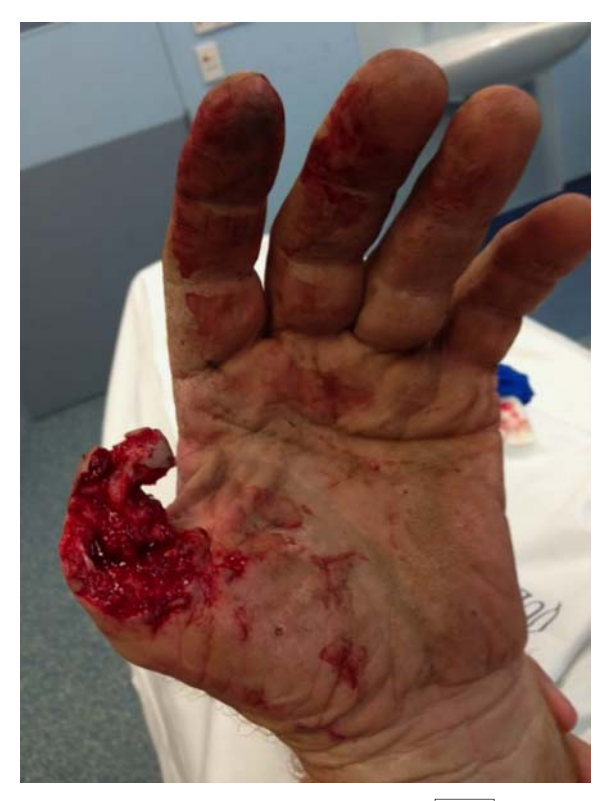
FIGURE 11. Thumb amputation through P1. full color

smooth bed for the FDP repair to glide in. On the dorsal side extensor tendon repair, venous anastomosis and skin closure without compression of the veins is performed. After reconstruction on the palmar aspect, the skin is closed.