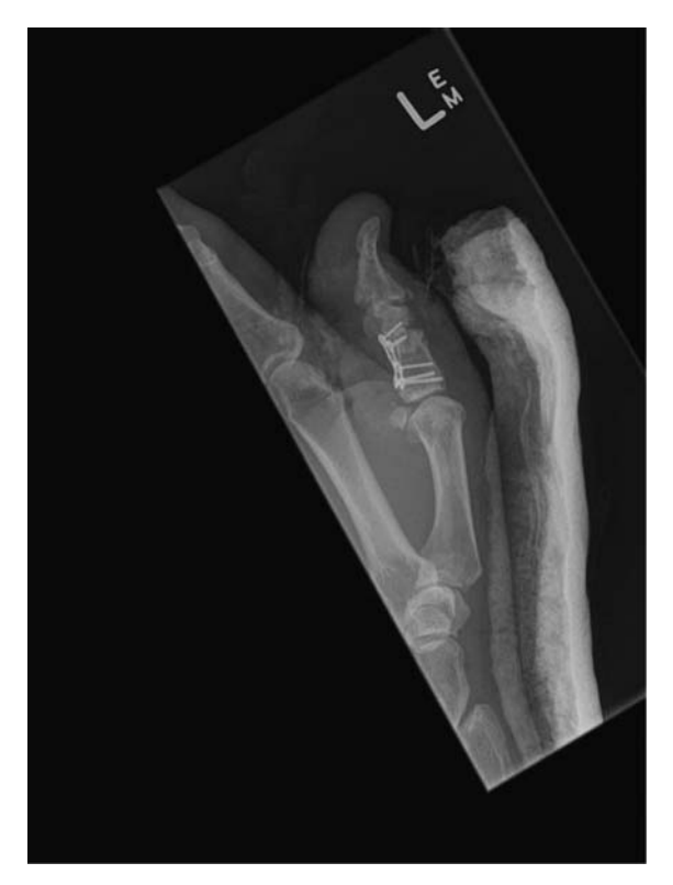
FIGURE 14. Osteosynthesis plate applied to the palmar aspect of the proximal phalanx of the thumb. Mobilization was started after 3 days and protected with a removable splint.

(Figs. 5–7) allowed an early active rehabilitation program to be commenced. Range of movement at 6 weeks is pictured in Figures 8 to 10. The second case involved a 19-year-old male who sustained a nondominant hand thumb amputation (Figs. 11–13). An osteosynthesis plate was applied to the palmar aspect of the proximal phalanx of the thumb (Fig. 14). Mobilization was started after 3 days and protected with a removable splint.