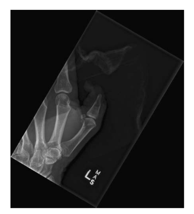
FIGURE 12. X-ray of thumb amputation through P1.

smooth bed for the FDP repair to glide in. On the dorsal side extensor tendon repair, venous anastomosis and skin closure without compression of the veins is performed. After reconstruction on the palmar aspect, the skin is closed.