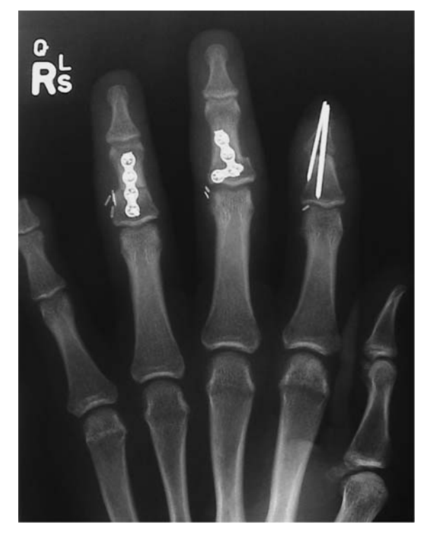
FIGURE 5. A 19-year-old male who had bilateral multiple finger amputations. Right hand fixation consisted of straight plate fixation of P2 ring finger; L-plate fixation of more metaphyseal fracture of P2 middle finger; K-wire arthrodesis of injury through distal interphalangeal joint.

layer. Repair of one or both flexor tendons is dictated by the nature of the injury and the level of the amputation. If the zone of injury is extensive and ragged with poor-quality tendon, we would be more likely to repair flexor digitorum profundus (FDP) alone and excise FDS. This is due to the greater likelihood of swelling and tendon adhesions. In circumstances