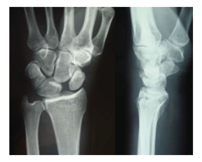
Fig. 4 Preoperative X-ray depicting scapholunate dissociation and undisplaced distal radius fracture of 40-year-old male.

In our cohort, we observed one patient who initially recovered well with good initial function and radiographic