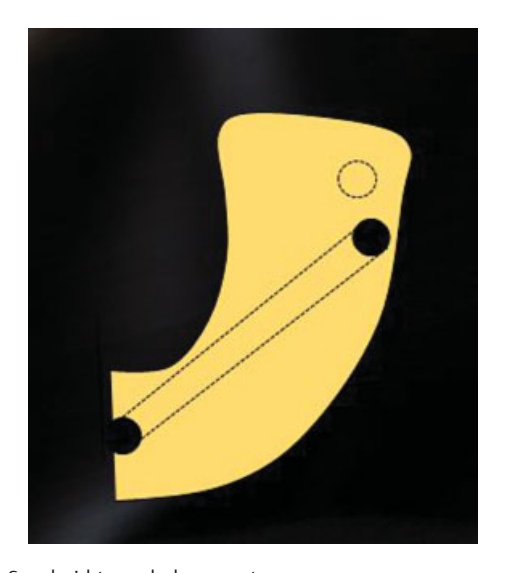
Fig. 3 Scaphoid tunnel placement.

Drill a hole using a 3-mm cannulated drill bit, in a process similar to a traditional Brunelli reconstruction, 3,4 except that the entry point dorsally is on the articular facet of the scaphoid for the lunate (not at the dorsal insertion of the SL ligament). The tunnel should be just dorsal to the center point of lunate facet of the scaphoid. The exit point on the volar side of the scaphoid is a few millimeters proximal and radial to the normal point that would be used for a traditional dorsal band reconstruction<sup>5</sup> ( \succ Fig. 2 ). The position of entry for the tunnel on the volar side needs to be accurate so that the tunnel can exit on the lunate facet of the scaphoid without violating the scaphocapitate joint just dorsal to the facet. The reason for this is that if the corresponding point on the facet of the lunate is volar to the midpoint, the tendon graft will travel obliquely, from dorsal on the scaphoid to volar on the lunate. This causes the graft to naturally reduce the rotary subluxation between the scaphoid and the lunate and correct the dorsal subluxation of the proximal pole of the scaphoid, as it is tensioned.