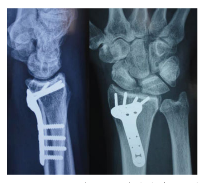
Fig. 5 Postoperative X-ray depicting ORIF distal radius fracture and scapholunate ligament reconstruction using the authors' technique.

A case example of a reconstruction for a static deformity and distal radius fracture is illustrated in Fig. 4 (preoperative X-ray) and ►Fig. 5 (6 months postoperative X-ray).